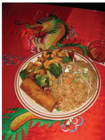
Dinner dish, Saigon Cafe