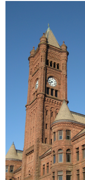
Bell Tower of Historical Old Central High School

All applications due to the Community Development Office, Room 407, Duluth City Hall, East 2nd St., Duluth, MN by 4:00 in the afternoon. Submit electronically only.