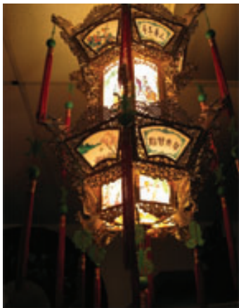
Lantern, Saigon Cafe