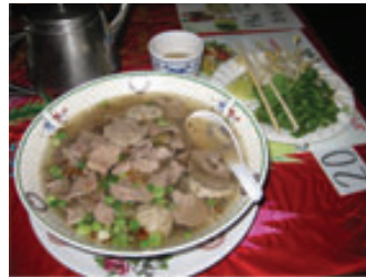
Pho Tai, Saigon Cafe